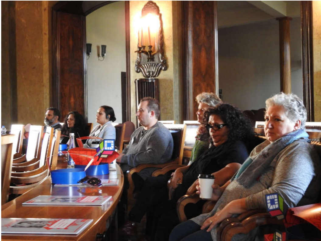
Ngarigo Friends at the Kosciuszko Conference room of the Council of Cracow.