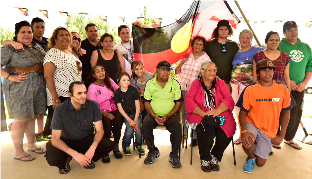
NAIDOC DAY, Ngarigo Families, Jindabyne 2014