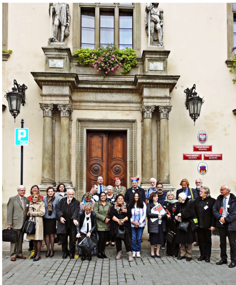
International Kosciuszko Conference participants in front of the Cracow City Council, 2017