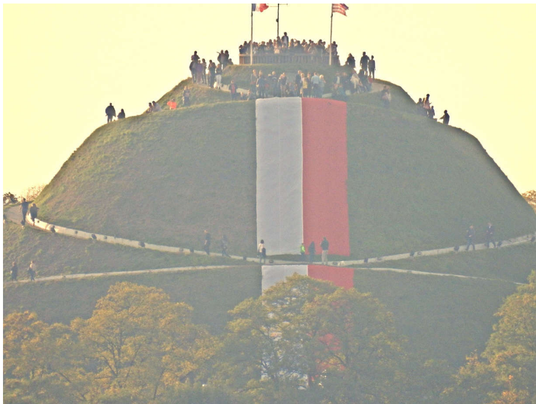
Kosciuszko Mound, Bicentenary Kosciuszko Year Celebrations, 2017.

https://www.youtube.com/watch?v=ZjMFgwx3POg&t=6s