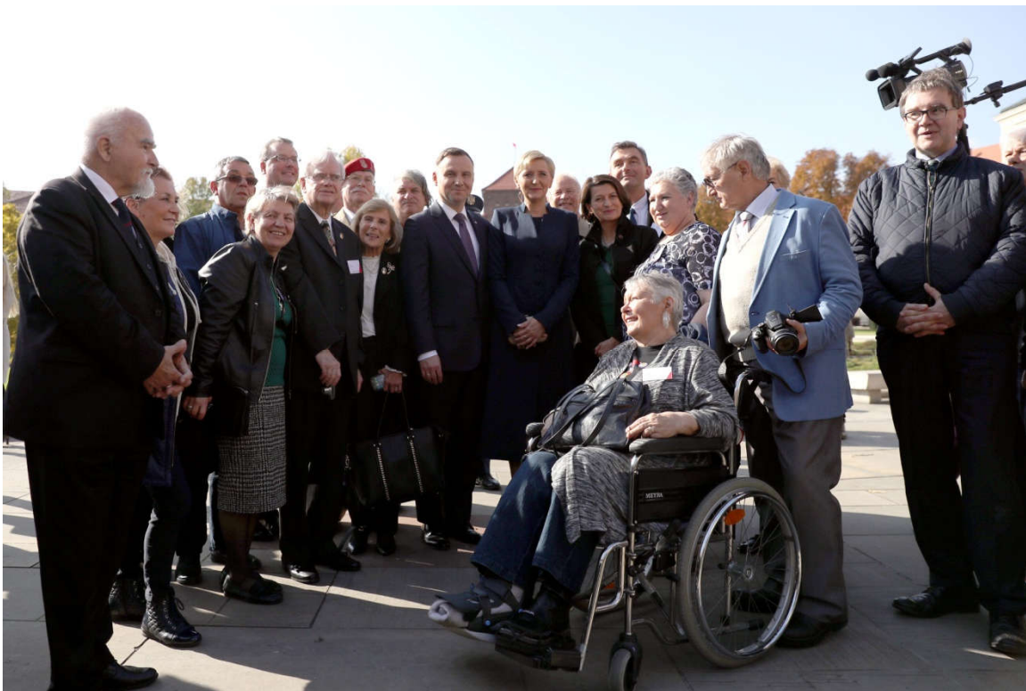
A photo with the President of Poland, Dr Andrzej Duda and the First Lady, Agata Duda-Kornhauser (at the centre).