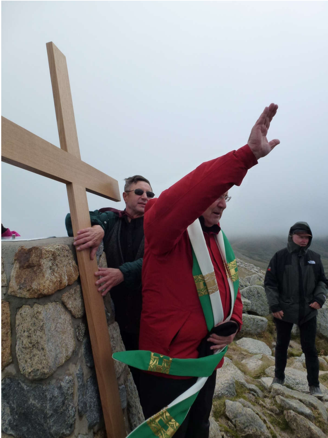
Blessing from Bishop Julian Porteous to Australia from the top of Mt Kosciuszko in 2013. The Centenary of the first Mass at Mt Kosciuszko.