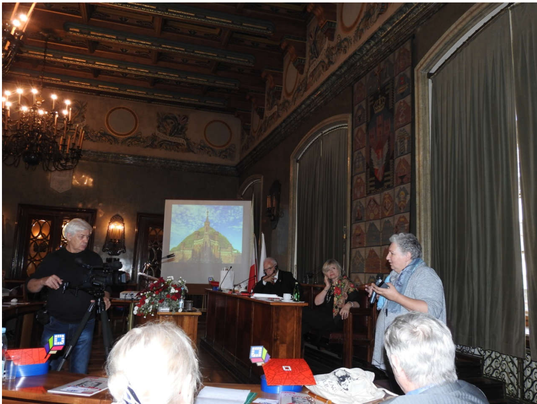
Kosciuszko Conference, Cracow 2017. Aunty Iris addressing the assembly.