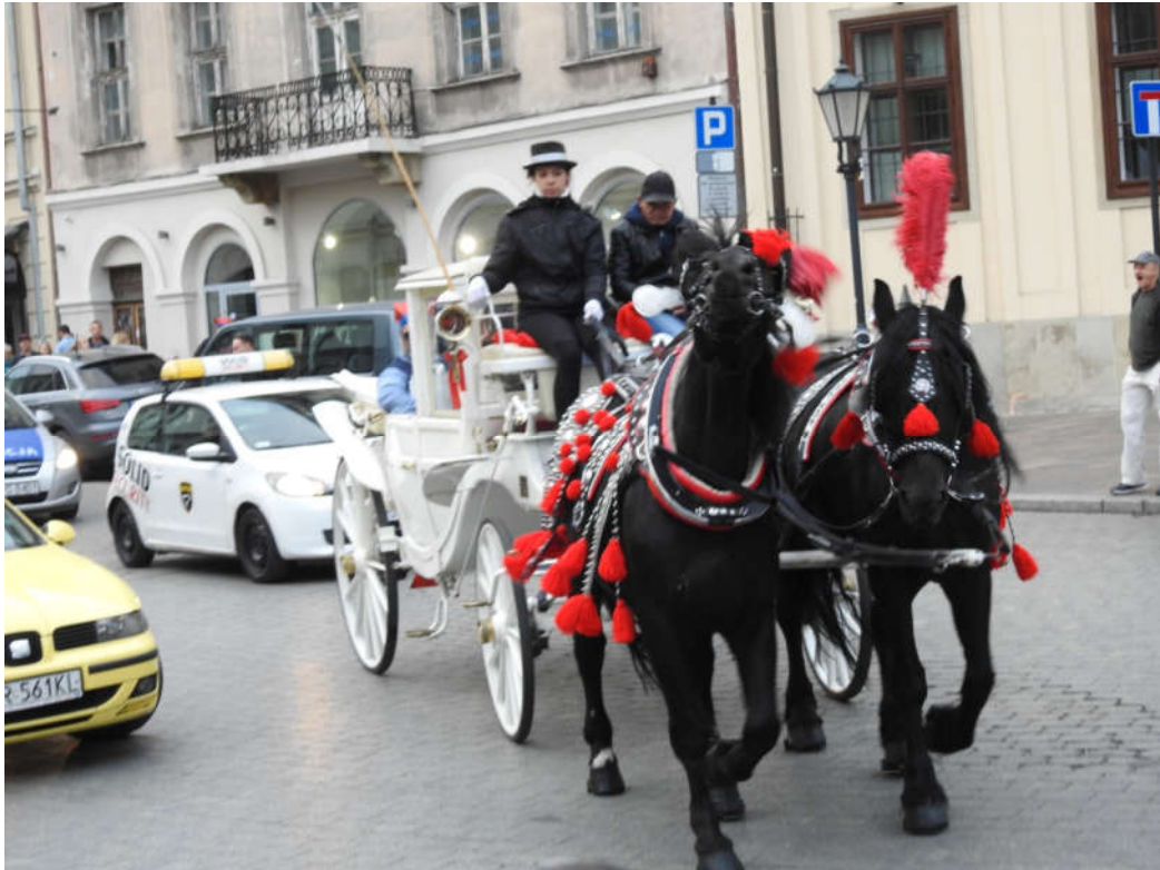
A traditional Cracow Cab ride over ancient streets. This one carrying the Dixon family.