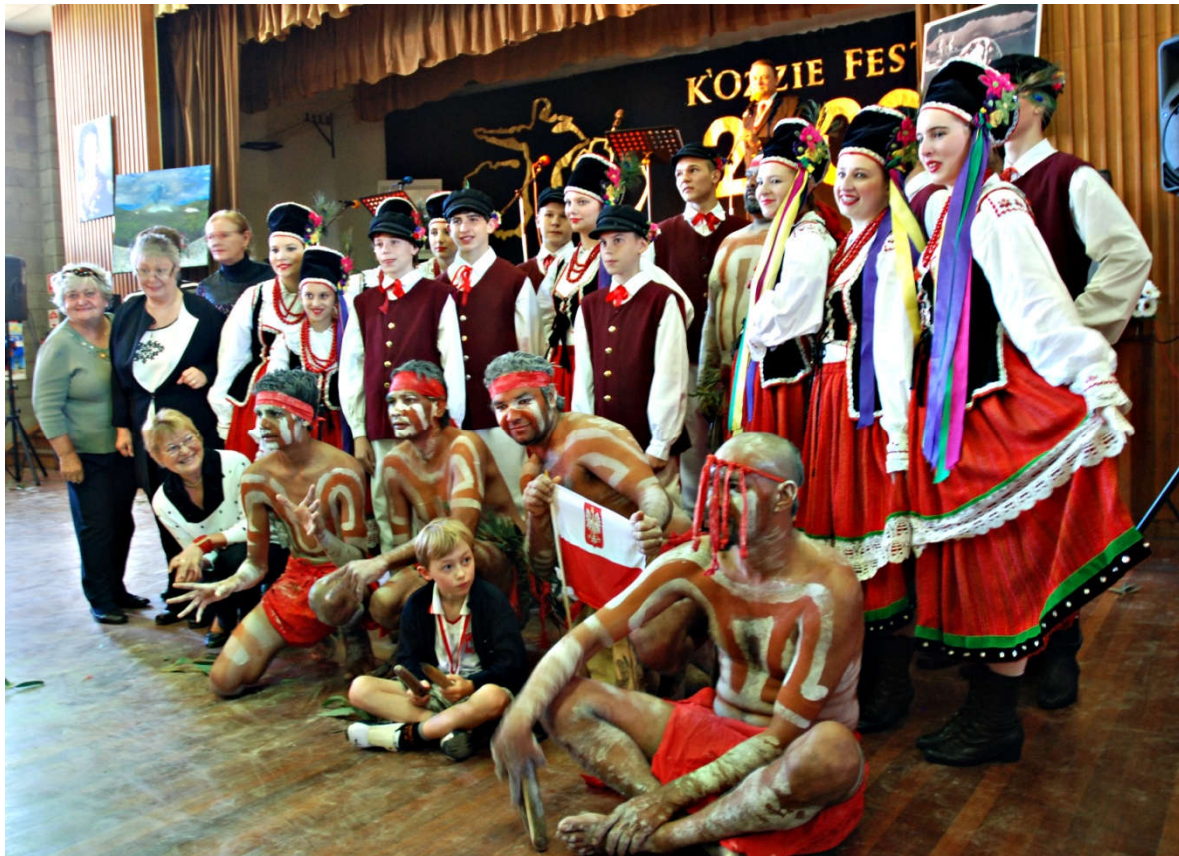
Kozzie Fest Jindabyne, 2009 – Lajkonik and Monaro Dancers