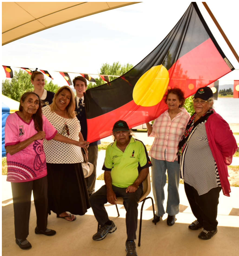
NAIDOC DAY, Jindabyne 2014