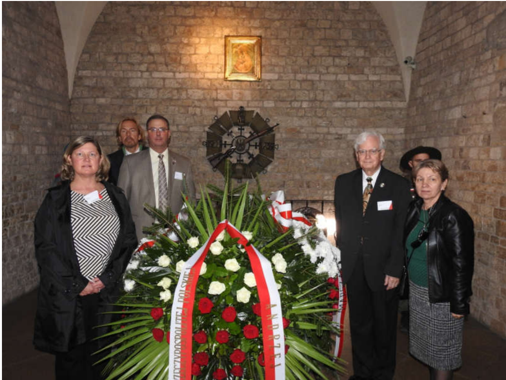
The American delegation at the Kosciuszko tomb at the Wawel Castle, Cracow 2017.